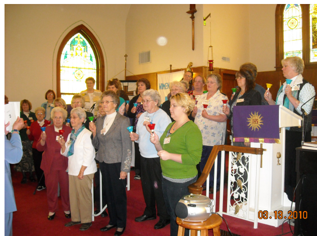
High Plains participants playing the color-coded bells.