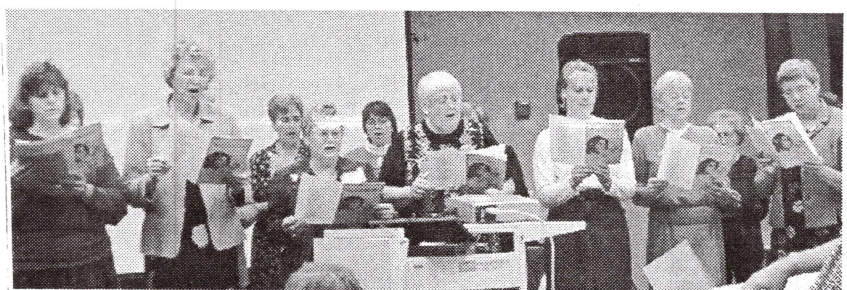
Convention choir provides music for Sunday worship.