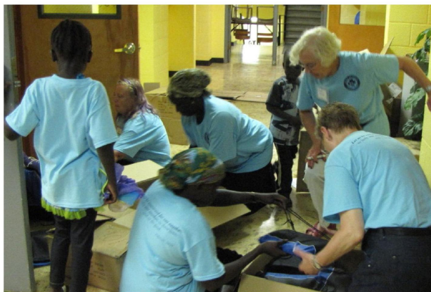
Sudanese and American women pack 119 school kits for Lutheran World Relief using an assembly line. The kits include school supplies collected by units across the state. Some backpacks were sewn at the event.