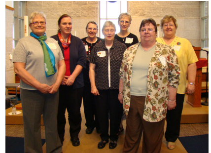
Midlands – Clowns for Christ; In-Kind Offering; 2013 Midlands Team