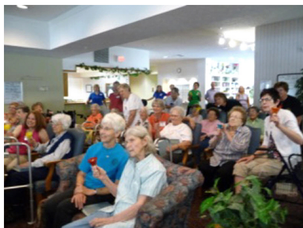
To close the worship service, joy abounded as the elder and the Saved To Serve participants thoroughly enjoyed ringing the colored bells.