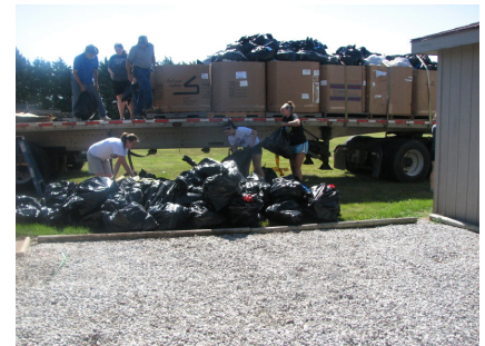
Southern Prairie – Registration time; visiting the Fair Trade booth; loading the shoes