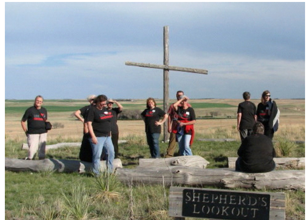
Some participants gather at Shepherd's Lookout to sing "Amazing Grace" and view the awesome miles of open prairie surrounding Sullivan Hills Camp.