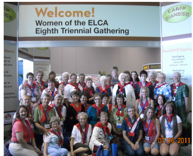
Thirty-five of the Nebraska attendees

The 2009-11 NSWO Officers and Board Members had these reflections to share regarding their experience after attending "Renew, Respond, Rejoice!"